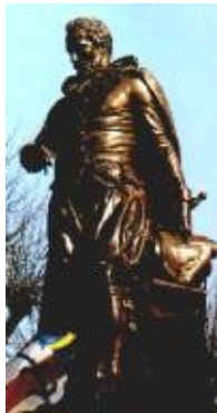
Figure 4: Simon Stevin's statue in Bruges

The mathematician Simon Stevin of Bruges (1548–1620) is famous for introducing decimal fractions into arithmetic. In a textbook of commercial arithmetic published in 1585 he set and solved the following problem: