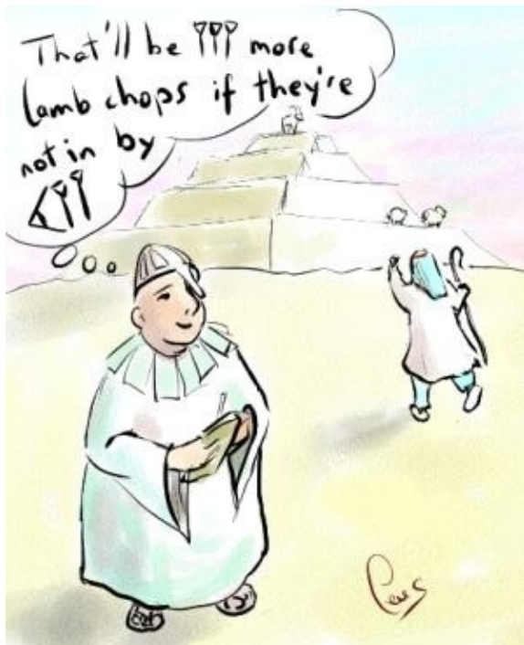
Figure 1: The real purpose of the ziggurat?

The application of mathematics to trade and financial affairs is as old as mathematics itself. History shows that as soon as a civilisation develops writing, including the writing of numbers, the new technology is used in financial transactions and the appropriate mathematical ideas develop rapidly.