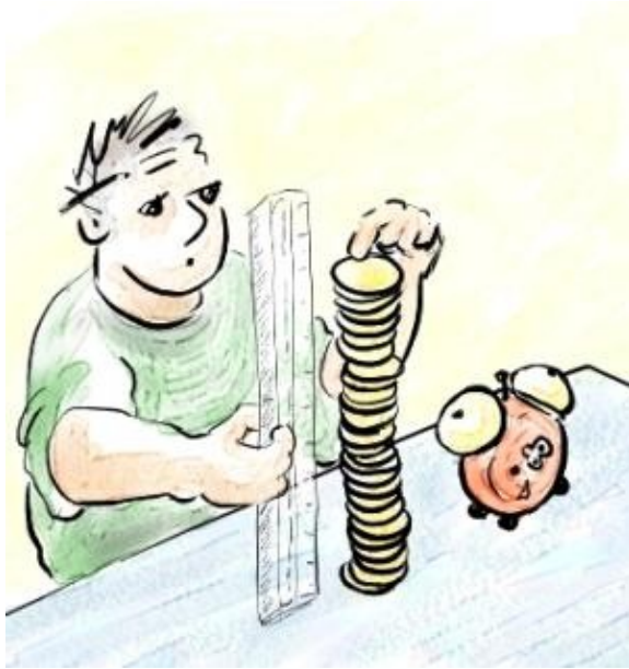
Figure 3: Time is money?

When you borrow money from a lender such as a bank, you pay the lender interest – a fee for the use of the money. Interest is charged as a percentage of the principle (the amount of the loan) for an agreed period, usually a year.