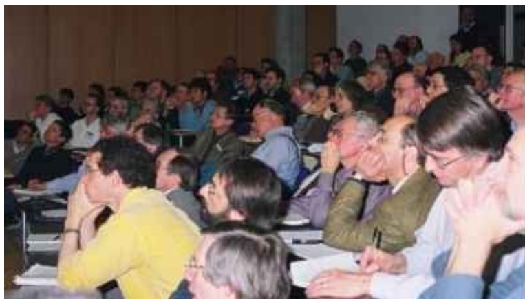
The conference audience

less cruel than experiments involving real Schrödinger cats!) to confirm his suspicions that we need a new theory to combine and explain quantum theory and general relativity.