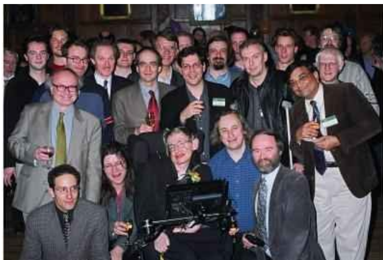
Professor Hawking with his students

Professor Hawking's birthday symposium was not just a chance for the academic community to honour these successes and achievements. A large crowd of students and members of the general public were there to wish him a happy birthday and to see some of the most eminent scientists of our day in the flesh. Even the Edge from U2 was there! The day was covered by television crews from Channel 4, the BBC and CBS in America, with a live webcast of Hawking's lecture direct to the BBC's website .