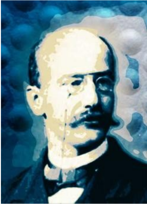
Ferdinand von Lindemann

The result was proved in 1882 by German mathematician Ferdinand von Lindemann – but amazingly amateur mathematicians have continued to produce fallacious "proofs" that the circle can be squared to this day!