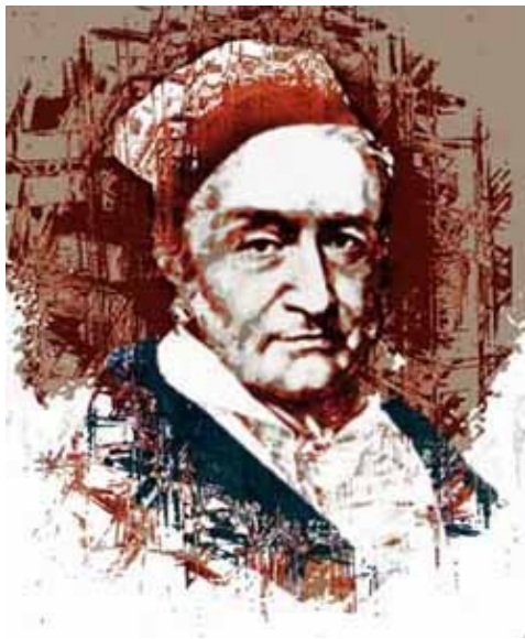
Carl Friedrich Gauss

In the words of the great German mathematician Carl Friedrich Gauss: "Mathematics is the Queen of the Sciences and Arithmetic is the Queen of Mathematics." The modern name for the branch of mathematics that Gauss was referring to as Arithmetic is Number Theory – the study of the properties of the positive whole numbers or integers. The 19th century mathematician Kronecker famously claimed that "God made the integers, all the rest is the work of man."