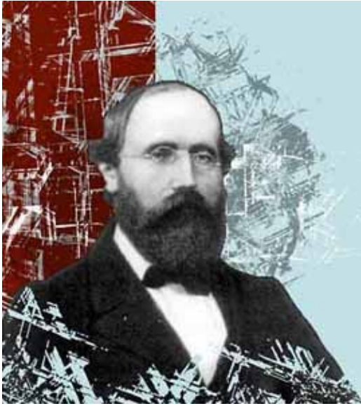
Georg Friedrich Bernhard Riemann