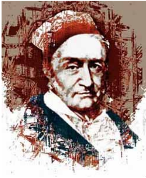
Carl Friedrich Gauss

In the words of the great German mathematician Carl Friedrich Gauss: "Mathematics is the Queen of the Sciences and Arithmetic is the Queen of Mathematics." The modern name for the branch of mathematics that Gauss was referring to as Arithmetic is Number Theory – the study of the properties of the positive whole numbers or integers. The 19th century mathematician Kronecker famously claimed that "God made the integers, all the rest is the work of man."