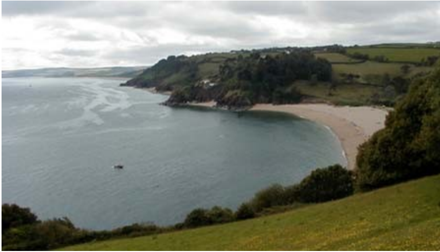
A bird's eye view of Blackpool Sands in Devon

I went to chat to the beach life-guard to explain what we were doing: investigating the coastal sea currents to try to predict where pollution might go. "And bodies!" he suggested. I was appalled; and yet horribly fascinated. Some internet research revealed a story about an Ontario fireman who tracked the bodies of people who had fallen into rivers[5]. He threw a bag of bran into the water at the person's point of entry, and followed the floating bran as it led him to the casualty. Of course, being able to predict where a casualty might float would be useful for the rescuers, who might then be able to anticipate the path of, and therefore catch up with, the casualty, rather than have to wait until the person came to rest. This prediction of the currents could usefully be attempted using a computer model, and indeed it has: a paper published in the Journal of Forensic Science describes the use of a coastal current computer model to predict the course of casualties[6].