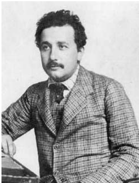
Albert Einstein around 1905.

Scientific celebrity has a relativity all of its own. Some scientists are celebrated by their peers, some are treasured by their students, while others are lionized by the public at large. But very few are given the burden of being a celebrity to everyone, everywhere, all the time. Albert Einstein achieved that universality. Publicists must despair that he did so in the pre-television era, without an agent or the help of a