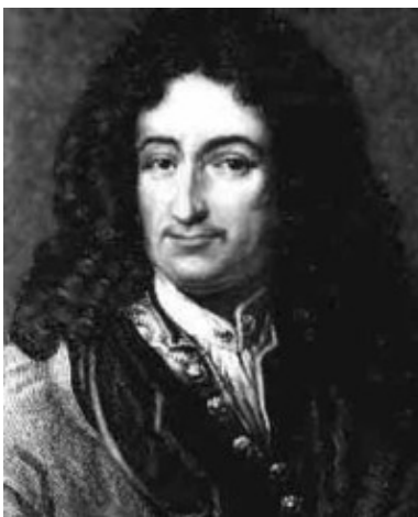
Gottfried von Leibniz

Both men worked on calculus in the second half of the seventeenth century. Pulling together various bits and pieces, and adding their own ingenious contributions, both succeeded in bringing structure into the jumble of ideas that had been calculus up to that time. Newton developed his method of fluxions , as he called it, a few years before Leibniz developed his theory, but Leibniz's work was published first. Leibniz had not been aware of Newton's work, and had approached the subject in a completely different way, but this didn't stop Newton from accusing Leibniz of theft.