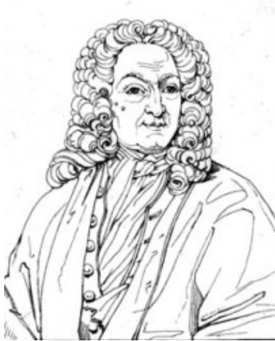
Johann Bernoulli I

The Bernoullis produced an astounding eight mathematicians over three generations. The sheer number of them, and the family habit of using the same first names, required the numbering system you see above to keep track of them all. And given the family's mathematical success, you would think that each generation was actively encouraged to study the subject. But instead the mathematical members of the family often had to study mathematics and astronomy against the wishes of their parents. Indeed there were enough quarrels, backstabbing and even untimely deaths among the Bernoullis to script a soap opera.