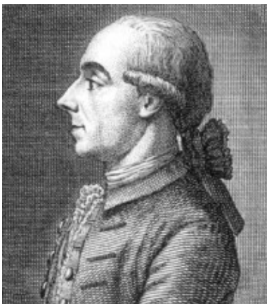
Johann Bernoulli III

Johann I's other two sons were also mathematicians. His favourite, Nicolaus II, worked on the problem of trajectories, and the mathematical arguments behind Newton and Leibniz's dispute over who had invented calculus. Johann II worked in mathematical physics.