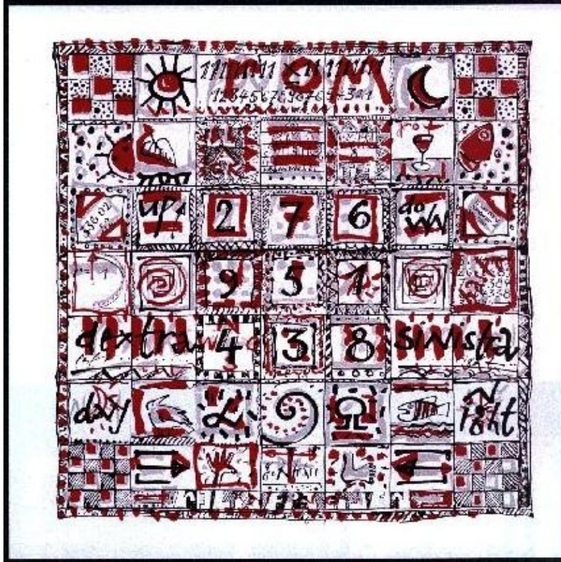
rot-gr \frac{1}{4} n. Serigraphie, 64 x 64 cm.