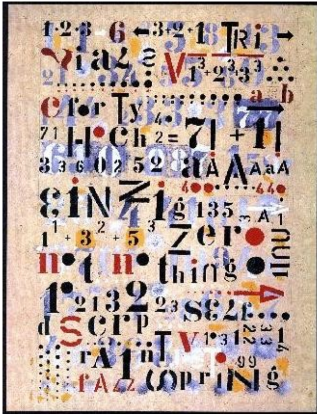
Picture Rainfall, Spring 1999. 60 x 83 cm.

Never has it rained so much in Switzerland in recent decades as it did this spring. Spring/Fall: A symmetric pair of words. In the picture above there are a lot of curious and interesting numbers.