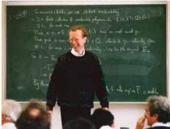
Andrew Wiles, the man who tamed Fermat.

This seems simple and has tempted many people to retire to a corner with paper and pencil and try to prove it. It is, however, devilishly hard and it wasn't until 1995 that Andrew Wiles , with the help of Richard Taylor, famously cracked the problem. Although the theorem is primarily a theorem about numbers, thus naturally belonging to the realm of number theory, to prove it Wiles had to wheel up heavy machinery from two other areas of maths: algebra and geometry.